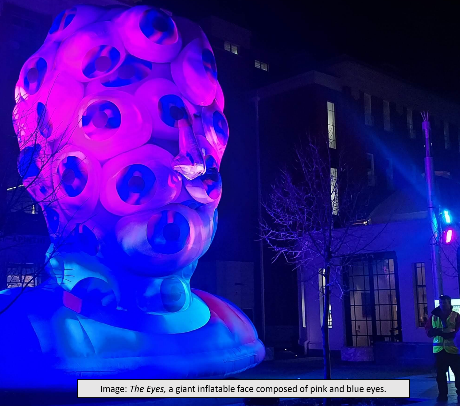
Image: The Eyes , a giant inflatable face composed of pink and blue eyes.