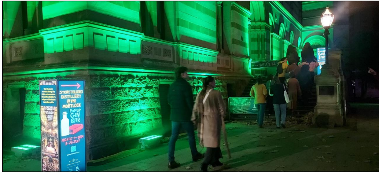
Image: Outside the State Library, the walls lit up green, is the entrance to the Pop-up Gin Bar.

There is a gin bar in the Mortlock Wing of the State Library.