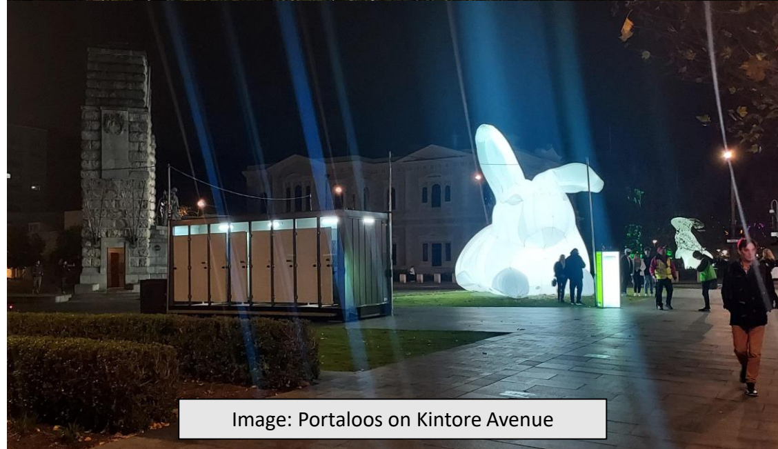
Image: Portaloos on Kintore Avenue