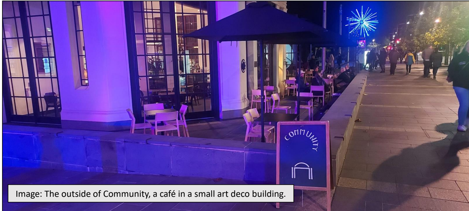
Image: The outside of Community, a café in a small art deco building.

A small café in Lot Fourteen, Community, is open late on Friday nights. This has outside tables which are wheelchair accessible.