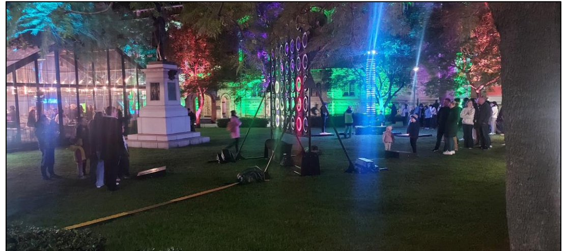
Image: On the University of Adelaide's lawns, children play Connect-4 with a giant light display.