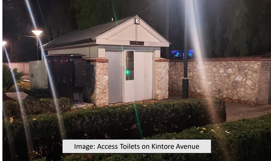
Image: Access Toilets on Kintore Avenue