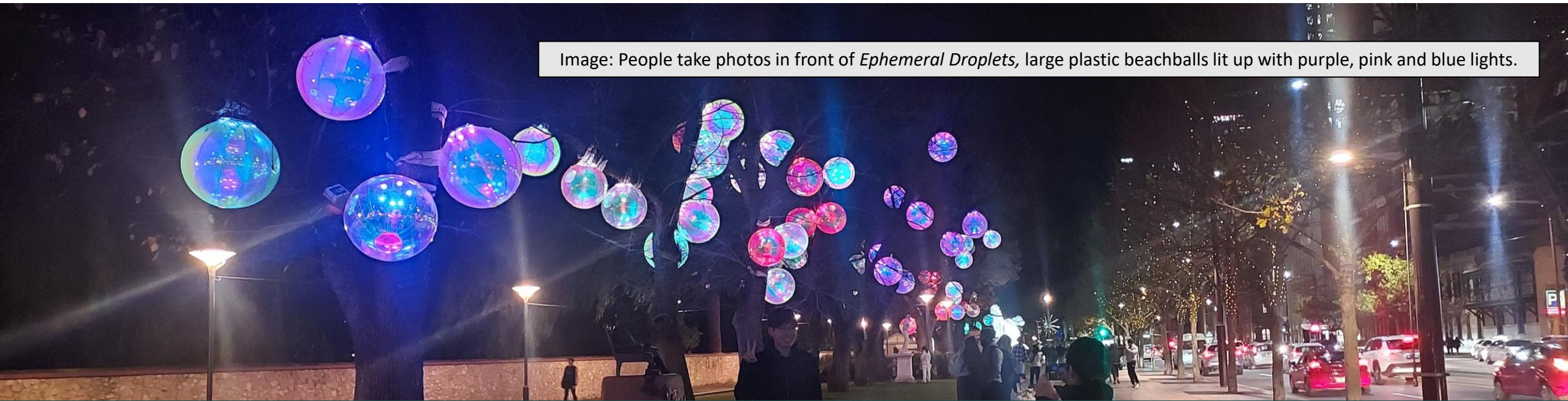
Image: People take photos in front of Ephemeral Droplets , large plastic beachballs lit up with purple, pink and blue lights.

Ephemeral Droplets , by Atelier Sisu, hang on the trees in this section of North Terrace.