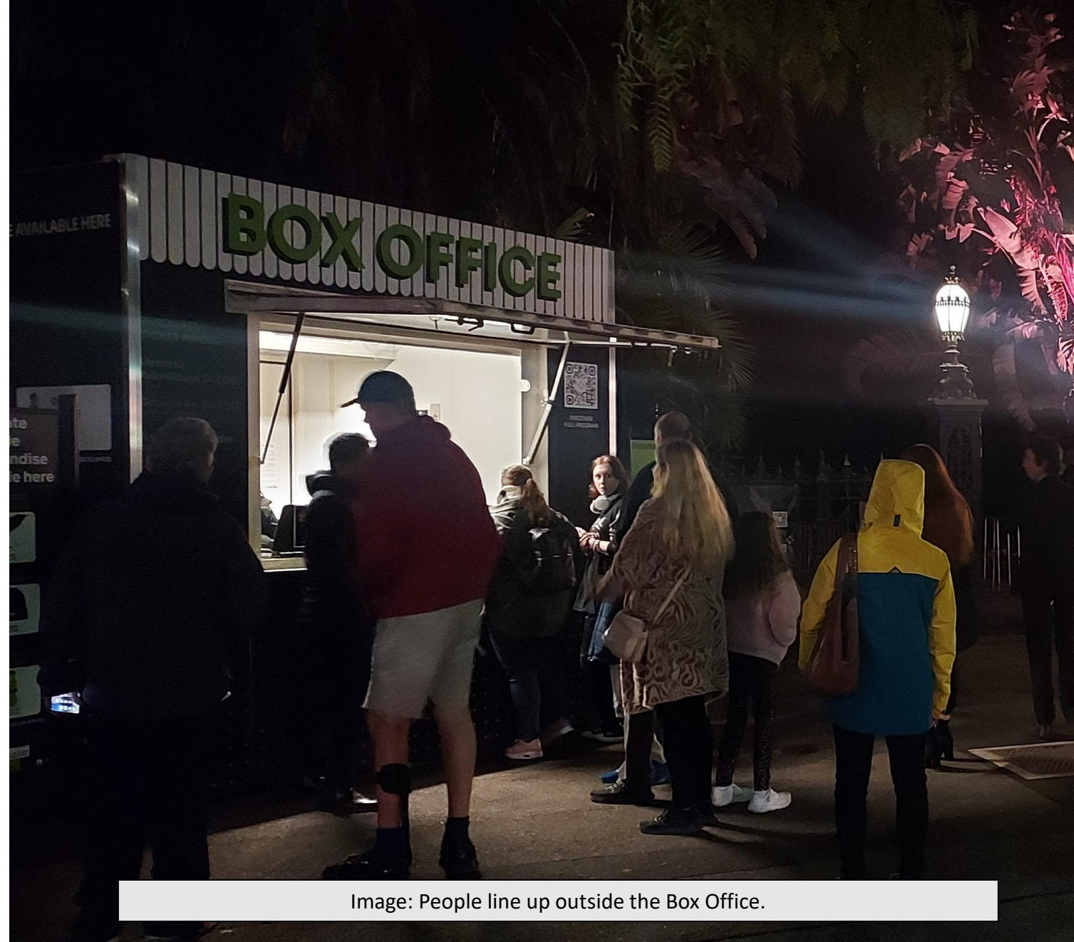
Image: People line up outside the Box Office.

This is where you can buy tickets to Illuminate Adelaide events, as well as Illuminate Adelaide merchandise.