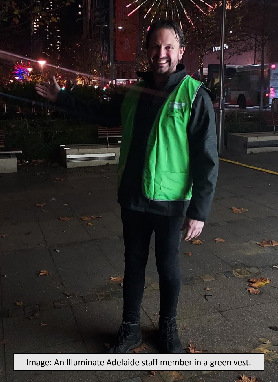
Image: An Illuminate Adelaide staff member in a green vest.